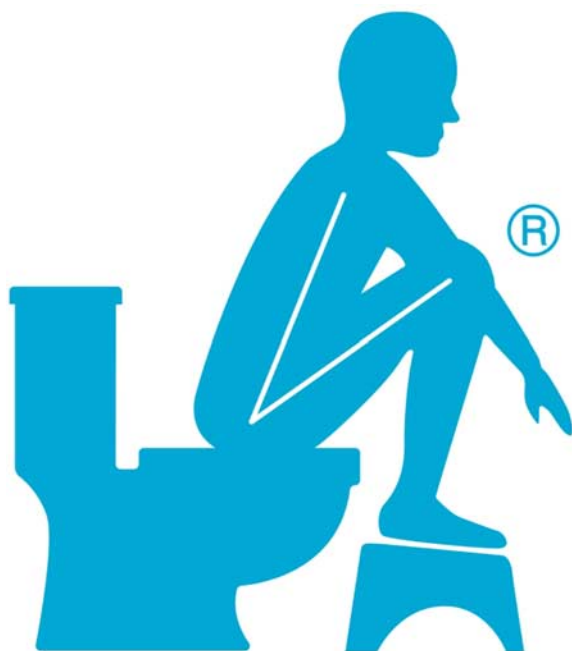
FIGURE 1. Defecation postural modification device demonstrating the change in anorectal angle. full color online

At study initiation, participants recorded BMs for a total of 4 weeks with the first 2 weeks without DPMD and subsequent 2 weeks with DPMD. BMs were recorded on Google Form with participants asked to respond to the same 5 questions: (1) participant number; (2) DPMD usage; (3) straining patterns; (4) bowel emptiness; and (5) time of BM (Table 1). Both straining and bowel emptiness scales are further delineated in Table 1. Responses regarding each BM were automatically uploaded and could be filtered based on participant number and DPMD usage. Participants were sent a postsurvey at the end of the study with subjective questions on their experience with the device.